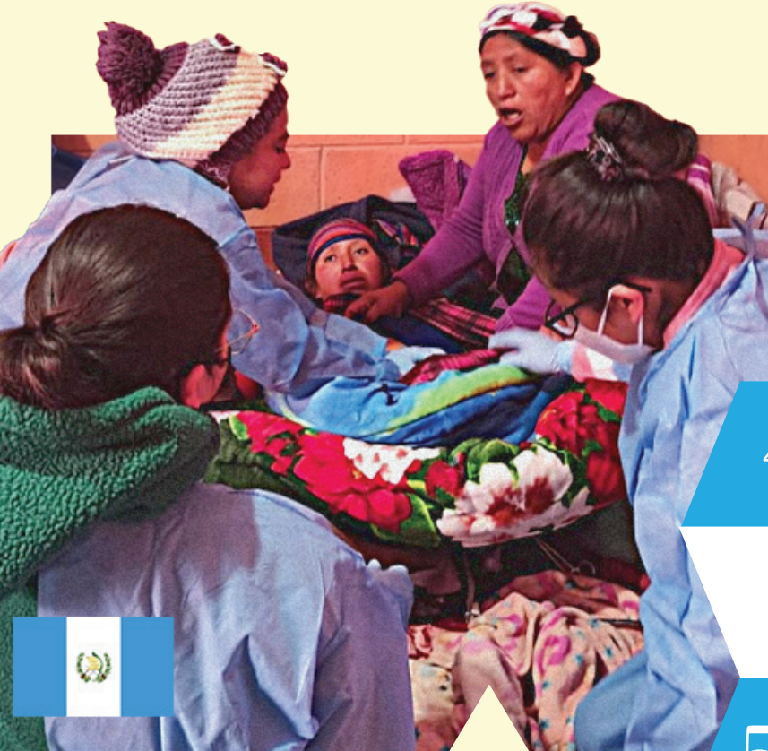
Traditional birth attendants work alongside clinic staff to attend to a woman in labor.

Dedicated to integrated community development, our partners in Guatemala are world class public health experts. They operate four “Casa Maternas,” community owned and operated maternity clinics that ensure equitable access to high-quality healthcare, including active community outreach.