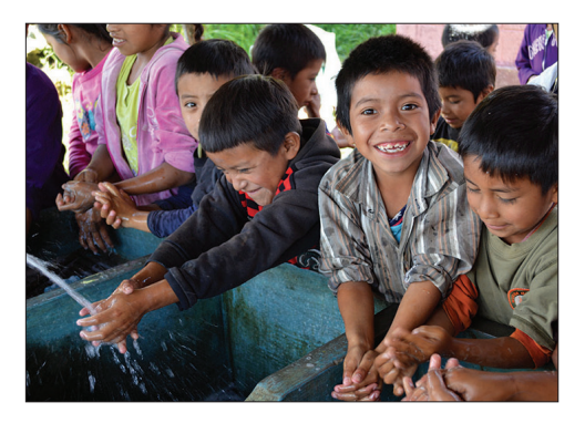
Guatemalan children practice washing their hands after attending a class by Curamericas Global staff.

Thanks to the support of our many donors and volunteers, Curamericas Global is able to bring lifesaving interventions like the Casa Materna to high-need communities. As a Board member, it was wonderful to see the gratitude and outpouring of support for the Casa Materna by the community, making clear their dedication to improving the health of their mothers and children. Many of the villagers had heard about the extraordinary impact of the Casa Maternas on other communities, and were excited to have the same services provided in their hometown.