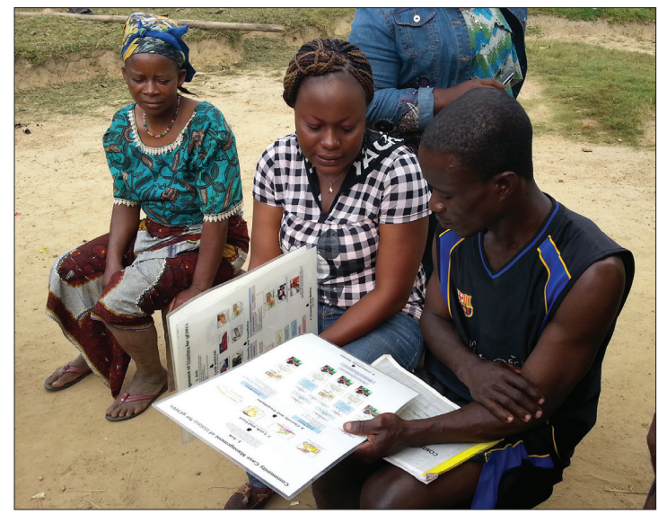
Curamericas Global staff reviews health precautions.

his year, West Africa has suffered from the worst Ebola outbreak in history. Ebola, which resurfaced in Liberia in March of this year, is a virus spread through contact with bodily fluids of Ebola patients