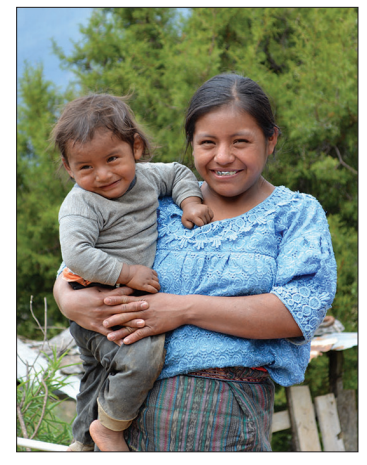
A mother and her child wait to receive his monthly checkup and vitamins.

Since the first Casa Materna Continued on back page